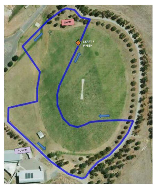
750m Under 7