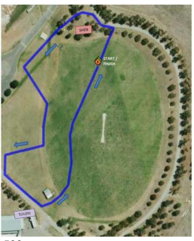
500m Under 6